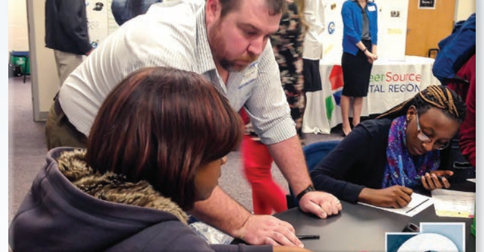
We now have a dedicated page on our website where you can see all the ways that we support community. Visit www.EnvisionCU.com/Community to see more.