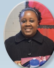
Elizabeth Calhoun Conley Elementary

Every quarter, teachers from all twelve of our counties compete for one of Envision's six $500 Classroom Grants to fund projects.