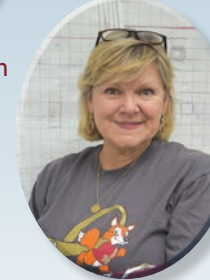
Cherly Nix Roberts Elementary