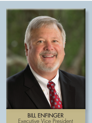
It is my pleasure to serve this institution and community as a result of the merger between FOCUS Credit Union and Envision Credit Union as Executive Vice President/Chief Lending Officer. I worked as the President/CEO of FOCUS Credit Union and had the tremendous and rewarding experience of serving the members and employees of FOCUS. The merging of these two credit unions will bring an extensive amount of experience and products which will benefit all the members of our newly combined credit union.

My new position has taught me several things about the new organization: