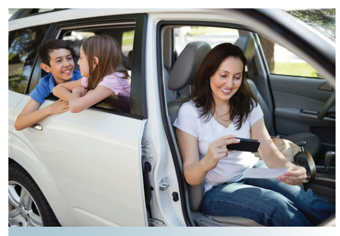
Envision Credit Union's eMobile app can be used virtually anywhere!