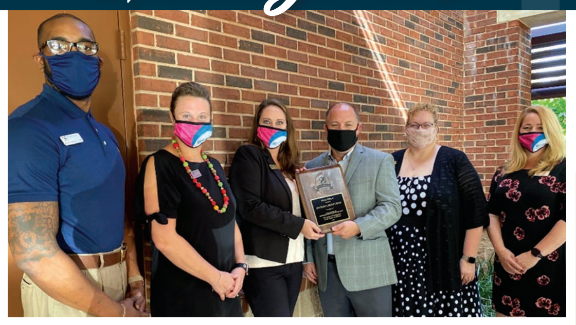
We are the proud recipient of the Desjardins award from CUNA as the League of Southeastern Credit Unions Florida recipient recognizing our support of financial education in partnership with the City of Tallahassee for 2019 Hurricane preparation. Envision reminded residents of the financial preparedness along with the city's physical preparedness aspect of their 2019 workshops.