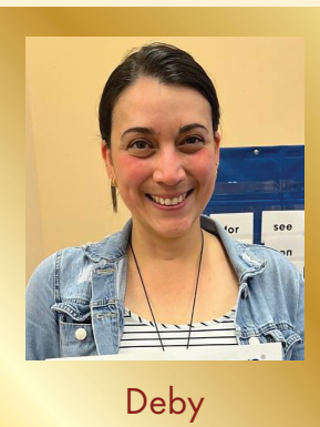
GEORGE W. MUNROE ELEMENTARY SCHOOL