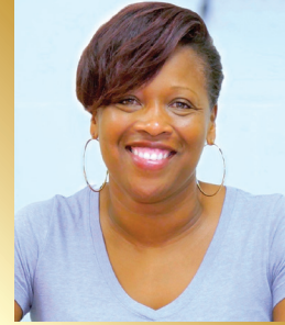
Ida BOND ELEMENTARY SCHOOL