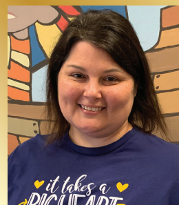
Krista SNEADS ELEMENTARY SCHOOL