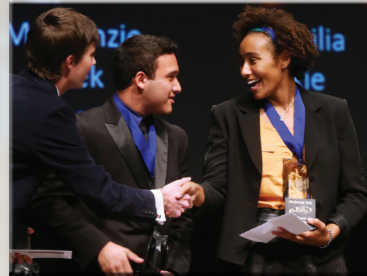
Best and Brightest Ceremony; Category winners congratulate each other.