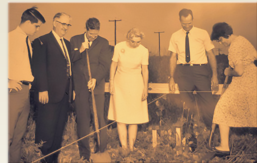
Groundbreaking for the construction of Leon County Teacher's Credit Union's Main Office Location at 243 Office Plaza Drive in Tallahassee, Florida.

To showcase our growth and prominent status in our community, the Credit Union purchased the old Tallahassee Federal Savings and Loan Association building in 1990, a community landmark, and made it